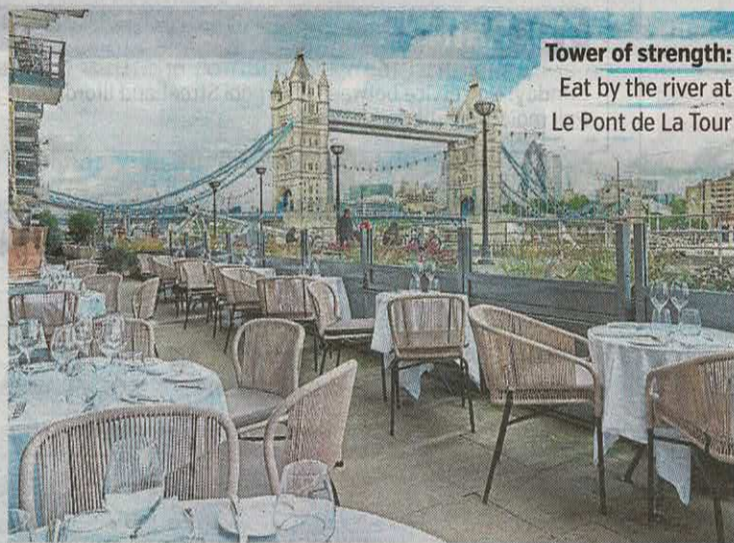
Tower of strength: Eat by the river at Le Pont de La Tour

Fitzrovia Greek restaurant Meraki is taking inspo from the goddess of love for its Valentine's Day Aphrodite set menu. You'll find oysters with taramasalata and lemon, moussaka