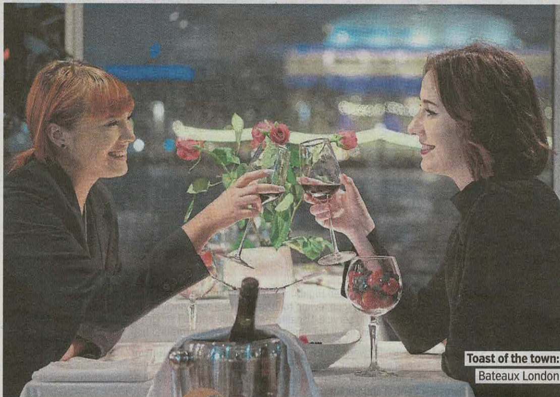
Toast of the town: Bateaux London