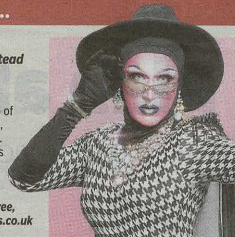
Eyes down: Drag yourself to the bingo

Feb 14 from 7pm, free, peckhamsprings.co.uk