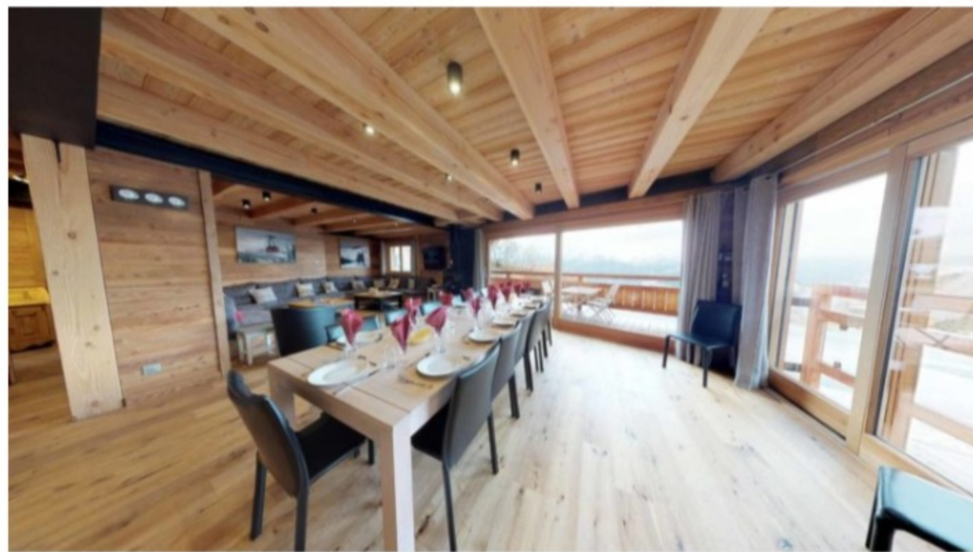
Chalet Woodpecker