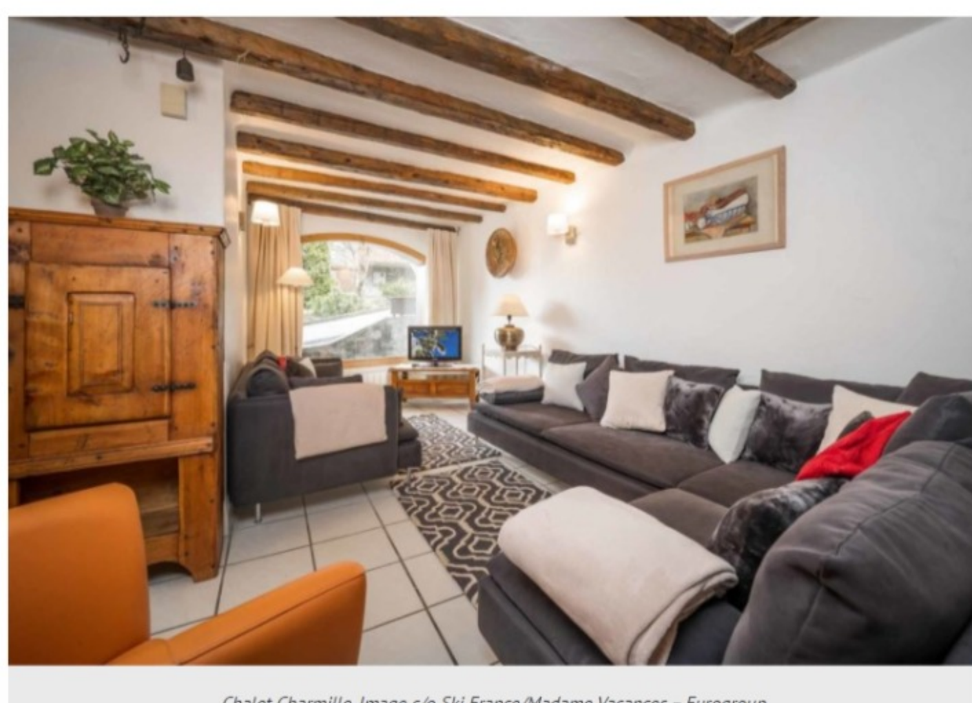
Chalet Charmille

Ski France has been specialising in holidays throughout France since 1988.