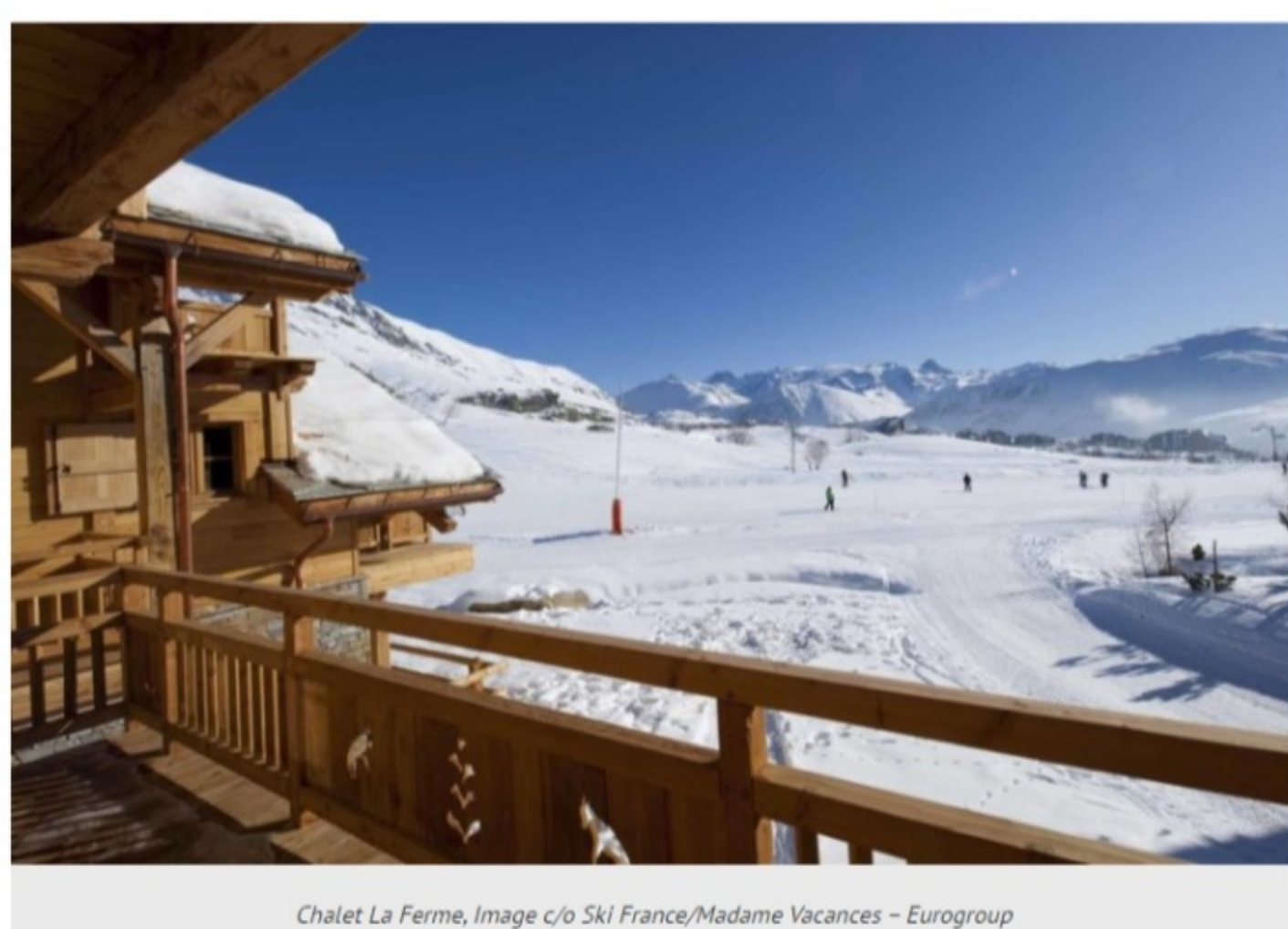
Chalet La Ferme