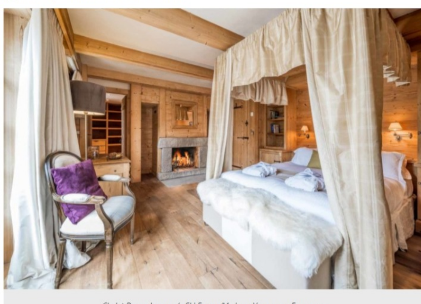
Chalet Davos

"The news of travel from an amber list country for people with a double vaccination is a very good development and we are continuing to take bookings in for next winter as we believe chalets remain a population option for UK skiers and snowboarders."