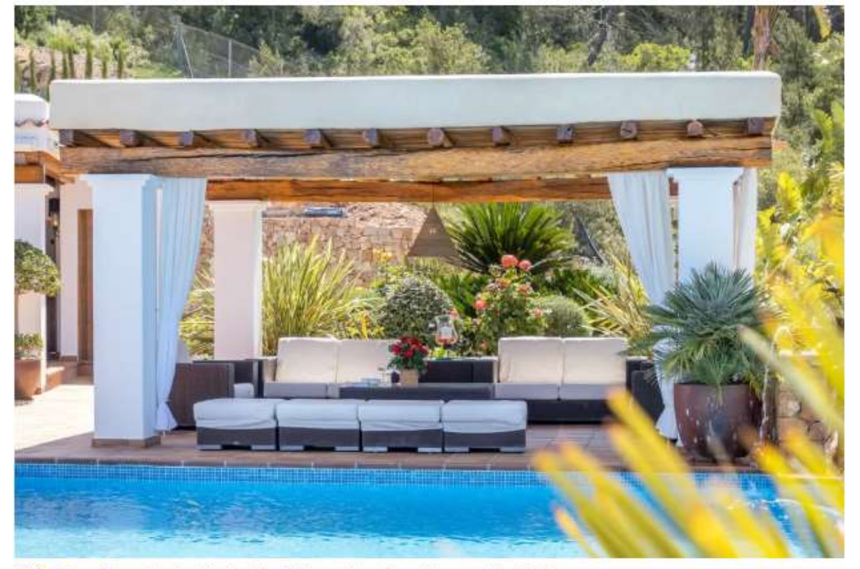
Villa Can Alma, Santa Gertrudis, Ibiza - sleeping 12 - new for 2022

Nestled in the centre of the island of Ibiza – a mere kilometre from the picturesque village of Santa Gertrudis – sits Villa Can Alma. Encircled by pine forest, olive groves and with views stretching out to the sea and town of Ibiza, Alma is ideal for those seeking the tranquillity of a secluded location alongside the galleries, eclectic restaurants and artisan boutiques that this nearby village has to offer.