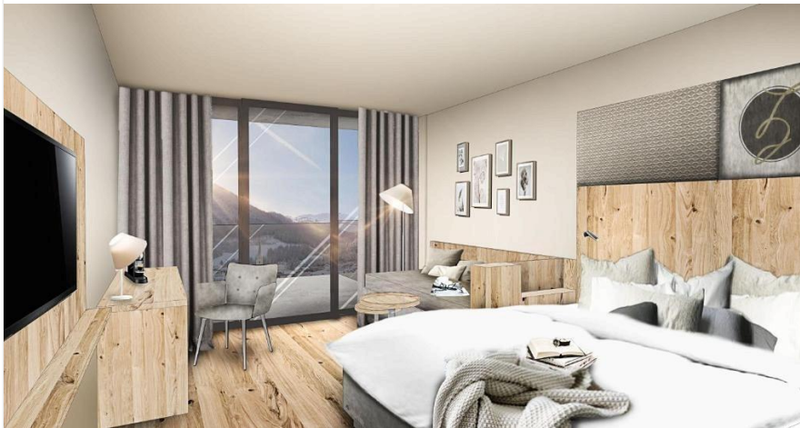
Zalwonder hotel has spacious bedrooms

Details Seven nights' half-board from £822pp including flights and transfers, departing on December 19 (neilson.co.uk)