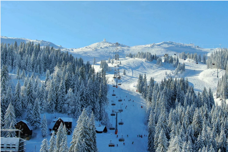
Jahorina was a venue for the 1984 Winter Olympics

mid-season weeks are still wide open — perfect for a group of hard-skiing grown-ups with their eyes on Val’s signature, straight-down-the-mountain piste: the Face. Details Seven nights’ half-board from £1,129pp including flights and transfers, departing on January 7 (skivertigo.co.uk)