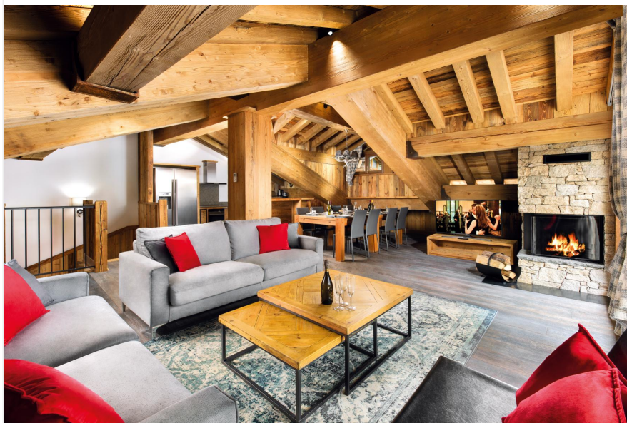
Val d'Isère's Chalet Whistler

Meanwhile other companies have got creative with the chalet concept in a bid to keep a lid on costs; where you see "chalet-board", that will include breakfasts, dinners and afternoon tea on most days. Ski France for example is offering a "contactless" catering service: delivering pre-cooked meals to your property while you're out on the slopes. There are new hotels and apartments to consider too, and even a new country to ski in — Bosnia. Add Travelski's new daytime Eurostar to the French Alps ( uk.travelski.com ), and it feels like skiing is at last beginning to pick up speed. Here are some of the winter's freshest holidays.