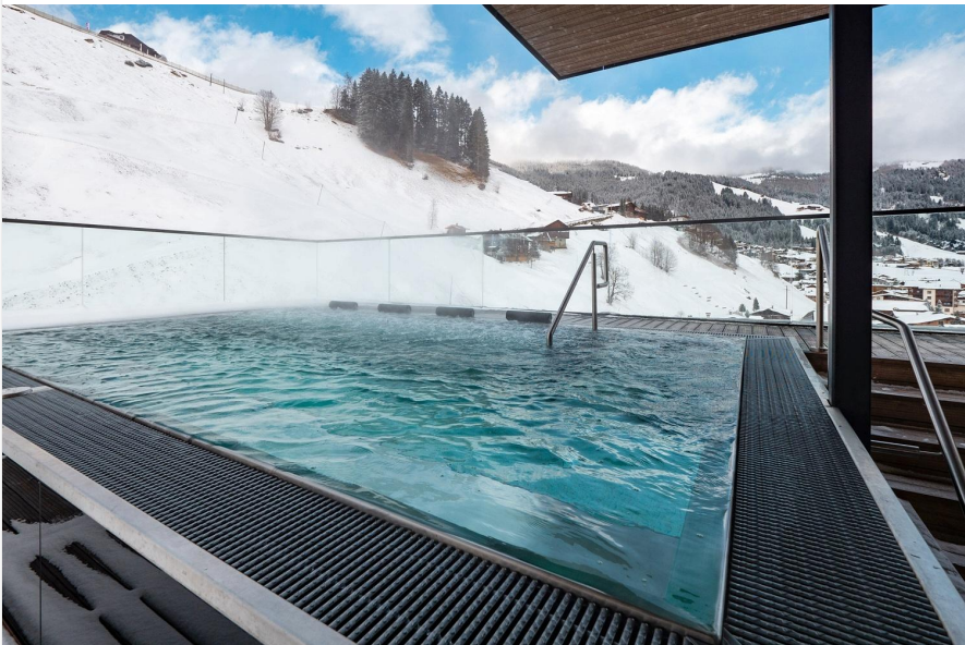
The spa pool at the Tirolerhof Tux hotel, in Hintertux, Austria

Details Seven nights’ self-catering for four from £564pp (villatrieste.it). Fly to Verona or Innsbruck