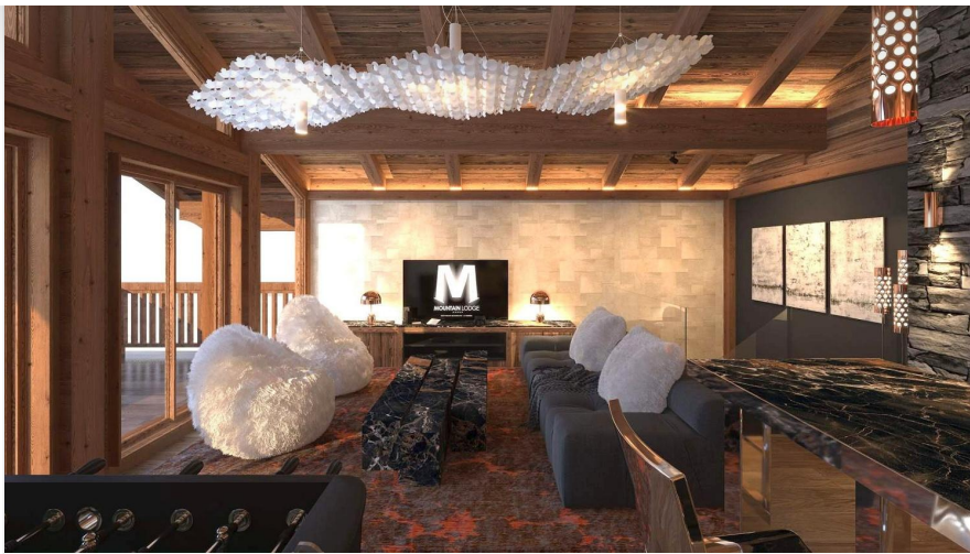
M Lodge hotel is built into the hillside at St Martin