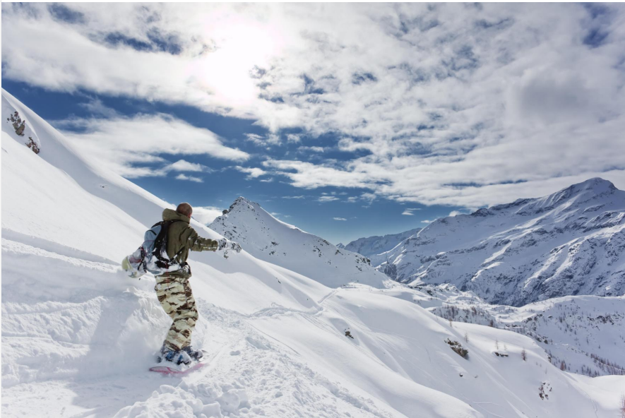
Snowboarding in Gressoney, Italy

Details Seven nights’ half-board from £982pp, departing on February 18 ( skifrance-classic.co.uk ). Fly to Geneva