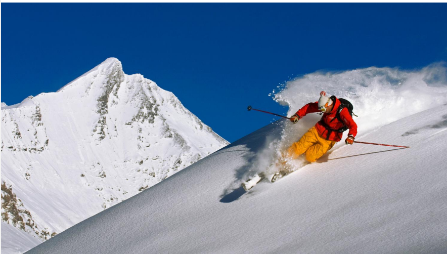
The French resort Tignes has an upgraded Club Med hotel for the new ski season