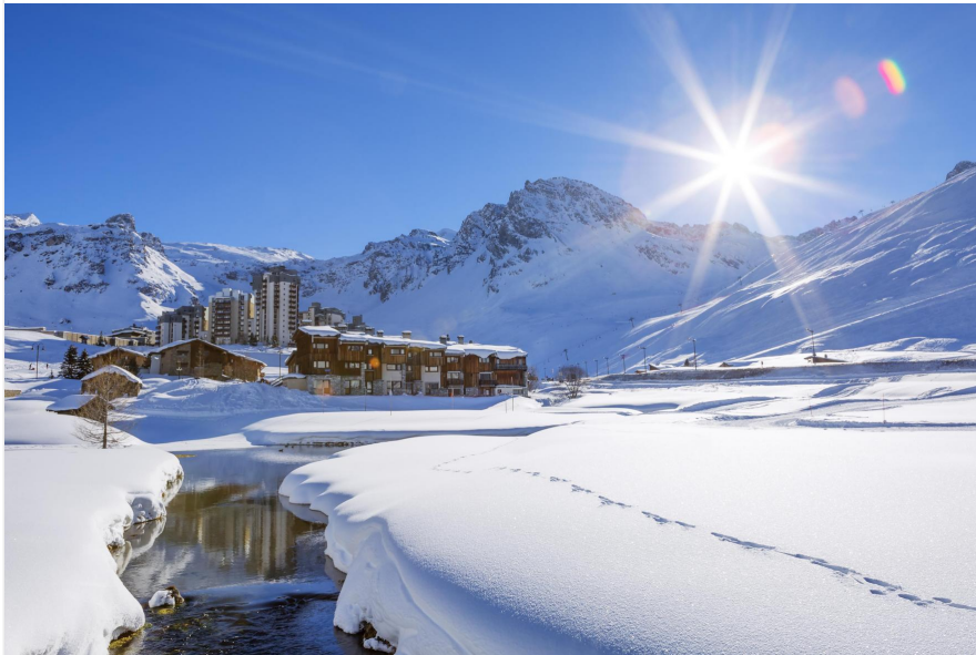
Tignes on a crystal-clear day