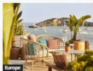
Europe Nobu Hotel Ibiza Bay Launches The Rooftop By Ibiza Bay