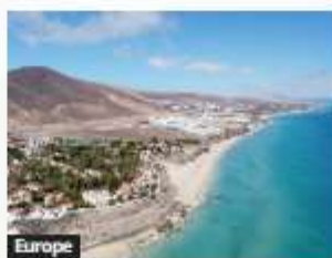
Europe Which Canary Island Should You Choose As Your Next Holiday Destination