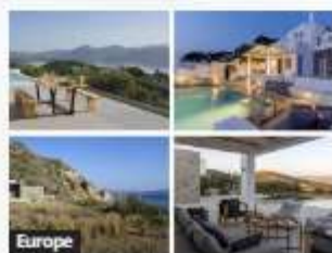
Europe Island hopping in Greece with StayOne