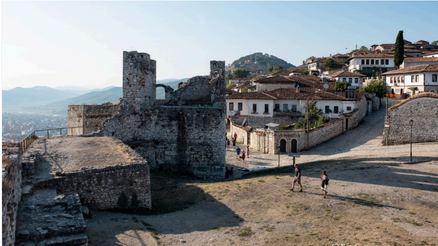
Intrepid's tour takes in several fascinating countries, including Albania (pictured), Croatia and North Macedonia

From Dubrovnik, the Croatian seaside citadel where you can walk on the old defensive walls, Intrepid's escorted tour explores the western Balkans. Highlights include admiring Kotor, a world heritage-listed Montenegrin city crowning a fjord, trying Kosovan crepes, cruising on North Macedonia's Lake Ohrid and shopping in the Ottoman-style Kruja Bazaar in Albania. There's still space on departures on August 24 and 31, with the latter reduced by £123pp, plus four September dates. Eleven nights' B&B costs from £1,924pp, including transport and activities (intrepidtravel.com). Fly to Dubrovnik