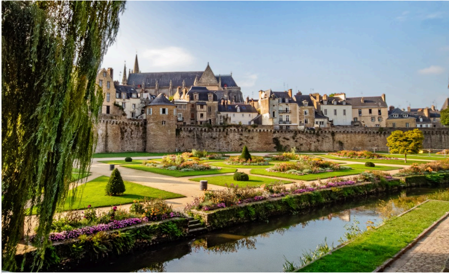
The fortified city of Vannes