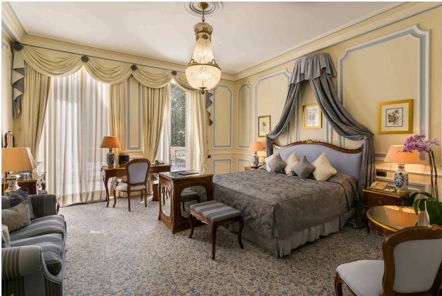
Lapa Palace is one of the most upmarket hotels in Lisbon

One of the city's poshest hotels, Lisbon's sculpture-lined Lapa Palace has an acclaimed fine-dining restaurant, plus an alfresco summer alternative serving lighter dishes; nearby, glorious