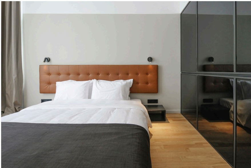
The Modernist Thessaloniki keeps clutter to a minimum

The Modernist Thessaloniki is aptly named: whether displaying mid-century, art deco or Scandi-style design, this svelte hotel in Greece's second city always keeps clutter to a minimum. A decked roof terrace affords sea views while guests are well placed for visits to the old port or White Tower. Thessaloniki is renowned for its Balkan-meets-the-Med food, and the staff can offer insider restaurant tips. Fifteen per cent savings are available on stays later this month: three nights' B&B costs from £167pp (mrandmrsmith.com). Fly to Thessaloniki