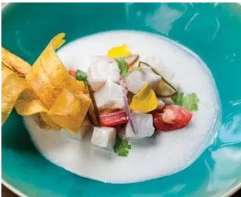
Barbados Foodie Guide