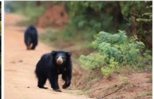
Presenting The Ultimate Adrenaline-Seeker's Adventure Bucket List