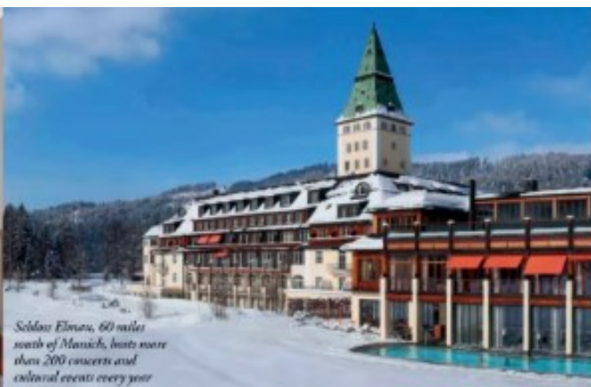
Schloss Elmau, 60 miles south of Munich, hosts more than 200 concerts and cultural events every year