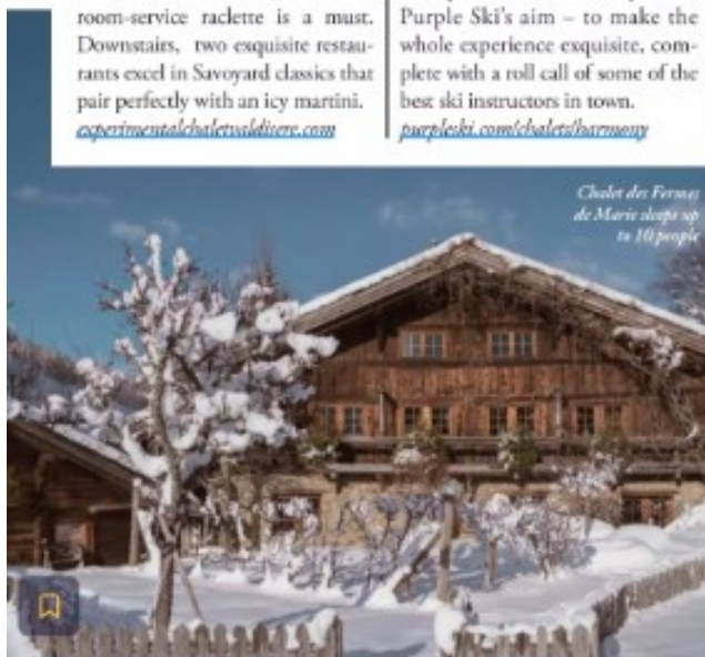
Chalet des Fermes de Marie sleeps up to 10 people

It doesn't get more sublime than sitting on your own snowy terrace as cheese fondue is served while you cradle a glass of warming Château Mouton Rothschild wine and take in the cool Alpine air. This five-bedroom cuckoo clock fantasy of a chalet is Heidi-meets-Ralph Lauren – all wood panelling, roaring fireplaces, deep bathtubs and squishy sofas – and it exudes an air of sophistication and ease, thanks to hotelier and interiors maven Jocelyne Sibuet. It's managed by the illustrious Fermes de Marie hotel, whose restaurant you can visit on a whim, fine-dining on ribeye and creamy gratin de crozets . Need to recalibrate? The on-hand spa therapists will resurrect your glow with Pure Altitude facials. en.fermesdemarie.com