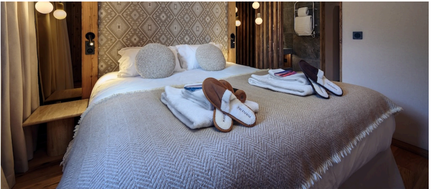
Chalet Cervinia Double Room