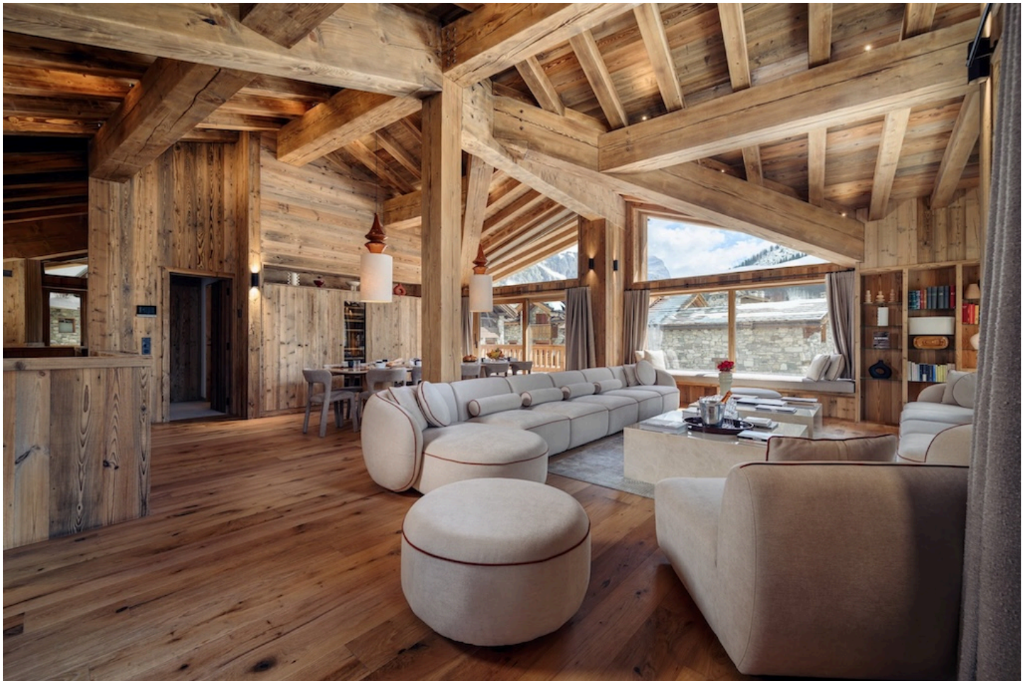
Chalet Cervinia Living Room