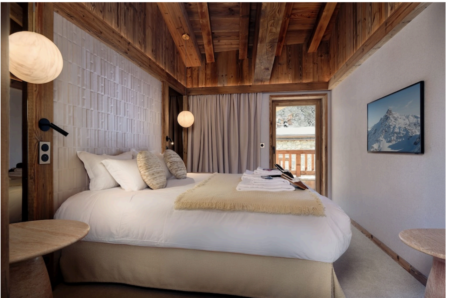
Chalet Cervinia Double Room

Spread across three elegant floors, Chalet Cervinia accommodates up to 13 guests . Five sophisticated double bedrooms , each with its own en-suite bathroom, ensure privacy and indulgence, while a charming children's bunk room completes the sleeping arrangements.