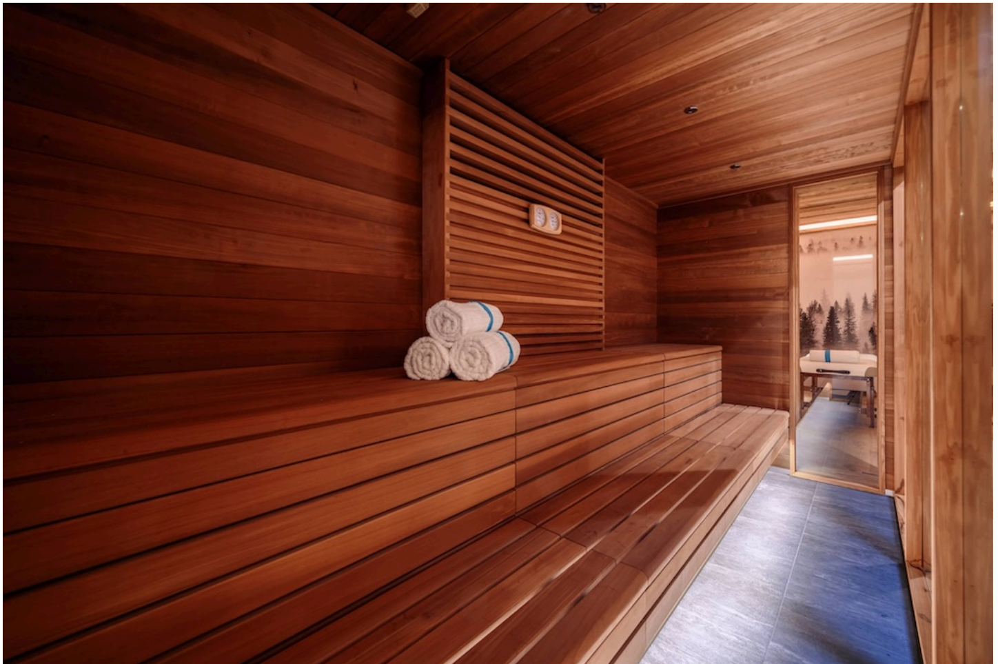
Chalet Cervinia Sauna

Après-ski here means so much more than hot chocolate and a blanket. The chalet's spa rivals those of luxury hotels, featuring a shimmering indoor swimming pool, a sauna, a hot tub, and a dedicated massage room — the perfect place to restore balance after a day on the slopes.