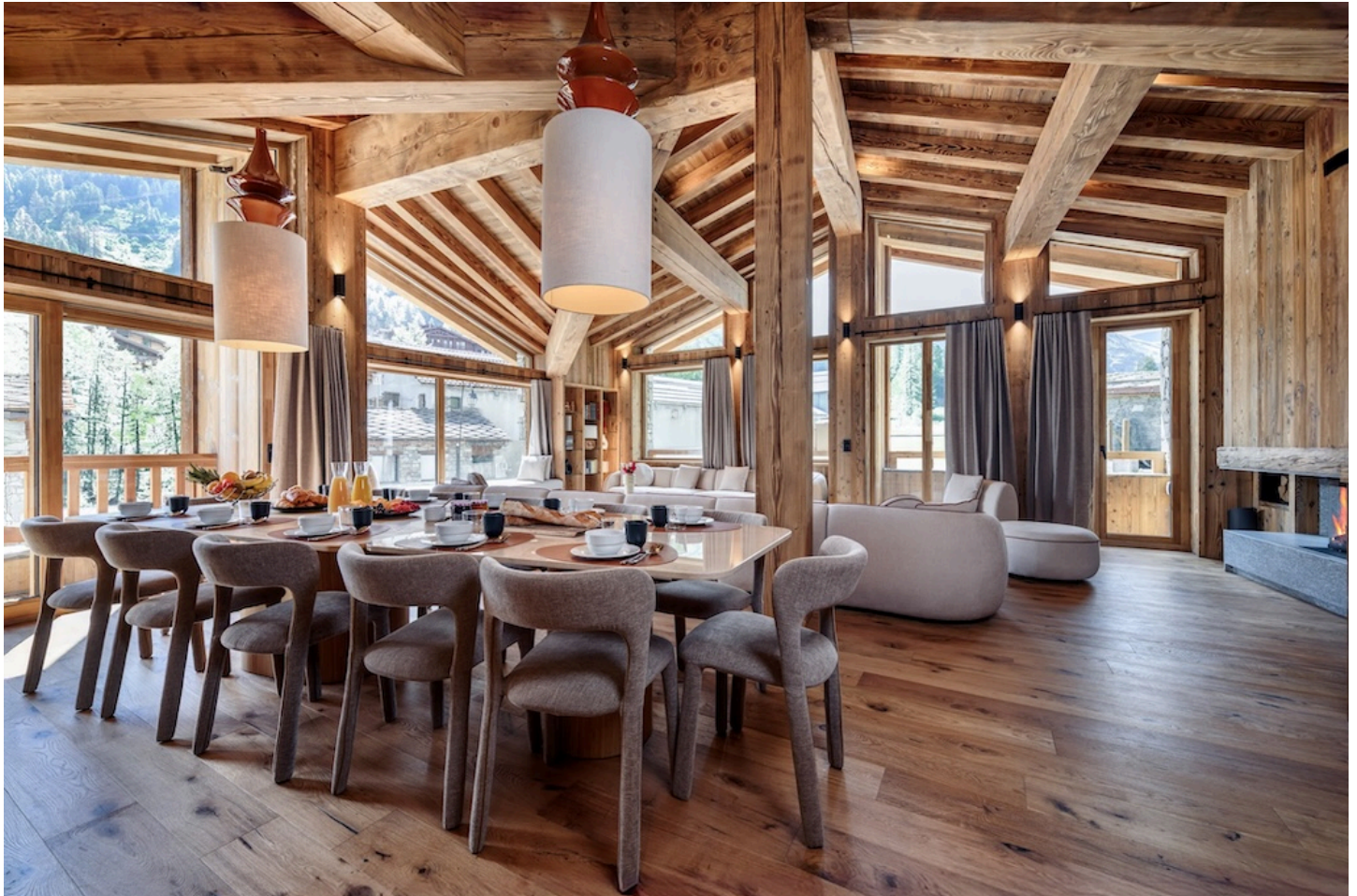
Chalet Cervinia Dining Room