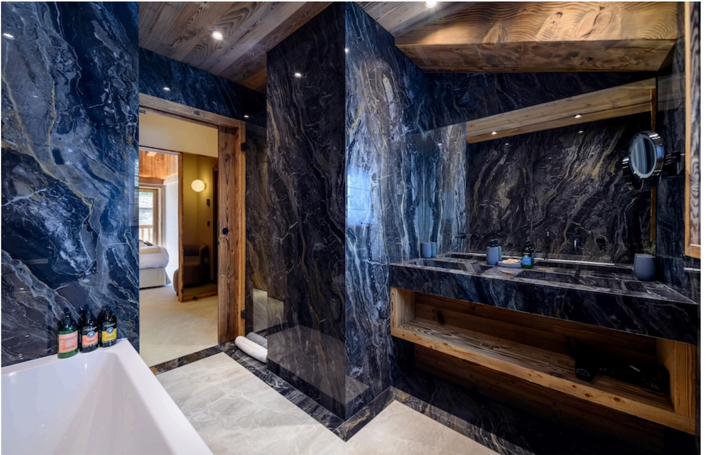
Chalet Cervinia Bathroom

Whether gathering as a family or as a group of friends, the chalet's open-plan living areas invite long evenings by the fire, glasses of vintage wine in hand, framed by sweeping alpine views.